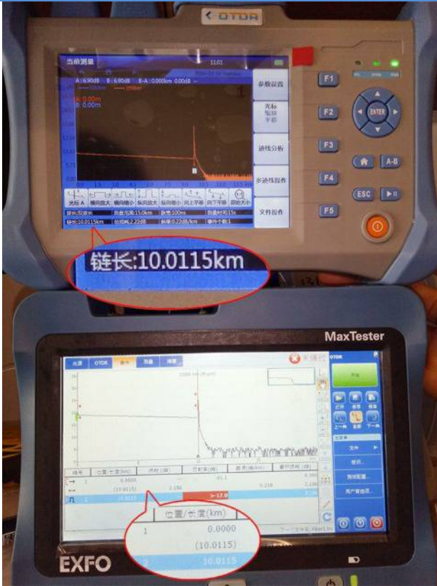
10 km test