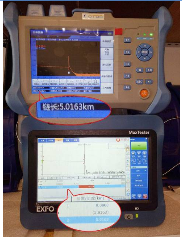
5 km test