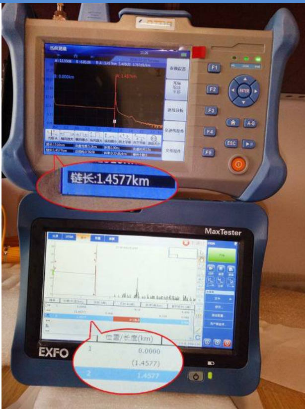
1.45 km test