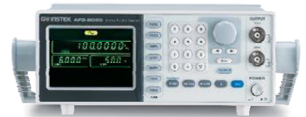
AFG-2000 Series Front